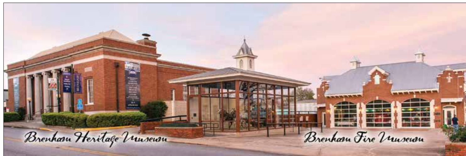
3. Brenham Heritage Museum 1915 105 South Market Street

Scan for more things to do and see in Downtown Brenham.