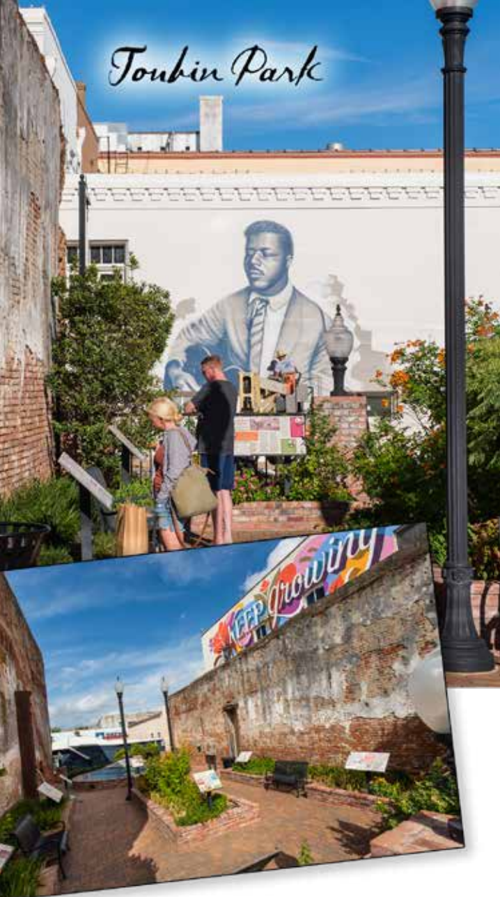
2. Toubin Park Circa 1880 208 South Park Street

Beneath Brenham streets is a State Archeological Landmark, the only system of historic public cisterns found in Texas. Learn how they were built and supplied with water by private businesses. It's a Wild West tale of an early railroad, a rough Boom Town, and inventive citizens who banded together in adversity.